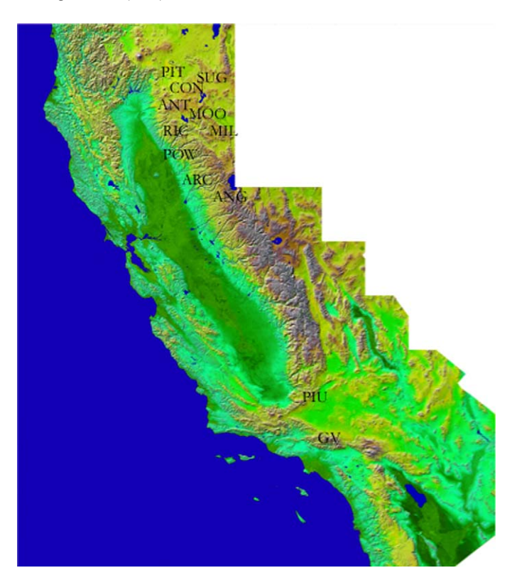
Fig. 1. Map of California showing the approximate location of the 12 wildfires analyzed in this study. Abbreviations: ANG–Angora, ANT–Antelope, ARC–American River Complex, CON–Cone, GV–Grass Valley, MIL–Milford, MOO–Moonlight, PIT–Pittville, PIU–Piute, POW–Power, RIC–Rich, and SUG–Sugarloaf.

In an effort to effectively pair untreated/burned and treated/burned stands we imposed several criteria. Paired stands must have similar slope, aspect, and slope position because these factors are known to influence fire intensity (Taylor and Skinner,