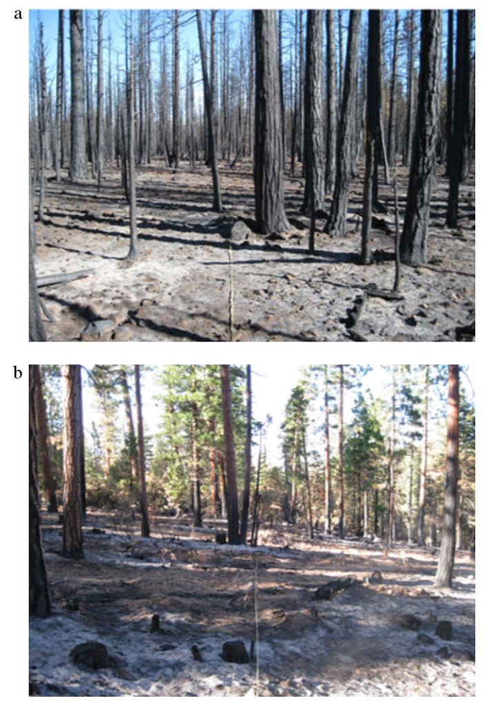
Fig. 2. Untreated (a) and treated (b) mixed-conifer stands 200 m apart in the Moonlight Fire, Lassen National Forest, California.

M.P. North, M.D. Hurteau / Forest Ecology and Management 261 (2011) 1115-1120